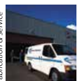
Fabrication & service

... and 150 service contacts more on www.ammeraalbeltech.com