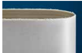
Leading competitor's equivalent belt

*results obtained after identical laboratory tests