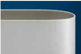
Ropanyl Premium Belt