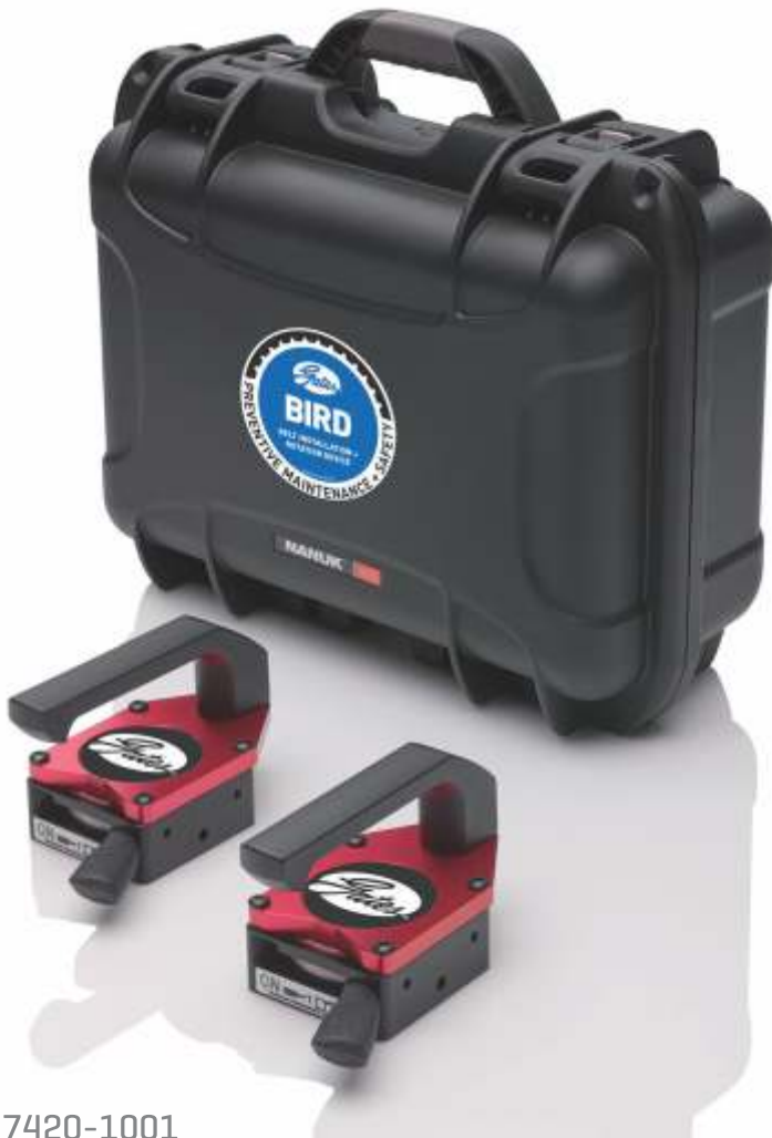
PART # 7420-1001

Visit www.GatesAustralia.com.au/BIRD to view the instructional video.