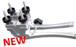
NEW FZ02/03 Guide Clamp