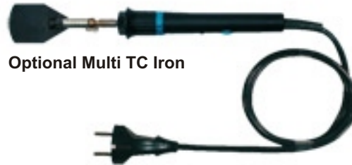
Optional Multi TC Iron