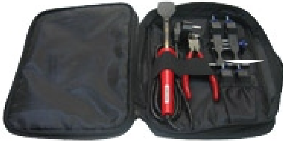
Standard Cord Weld Kit