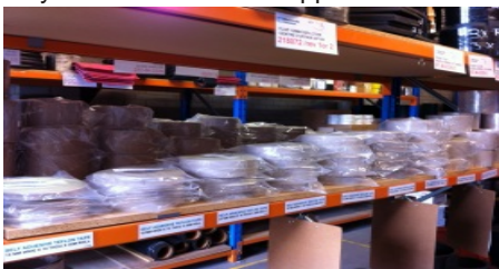
PTFE Teflon tape inventory

We supply a full range of teflon and silicone belts and tapes for all your heat or release applications.